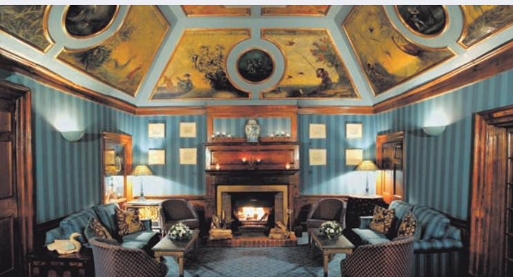
The Monkey Room

Monkey Island's twenty-six rooms and suites can accommodate guests overnight or the island can be booked for your exclusive use – only you, your guests and our staff will have access to our listed buildings and extensive grounds – your own country house for a full twenty-four hours.