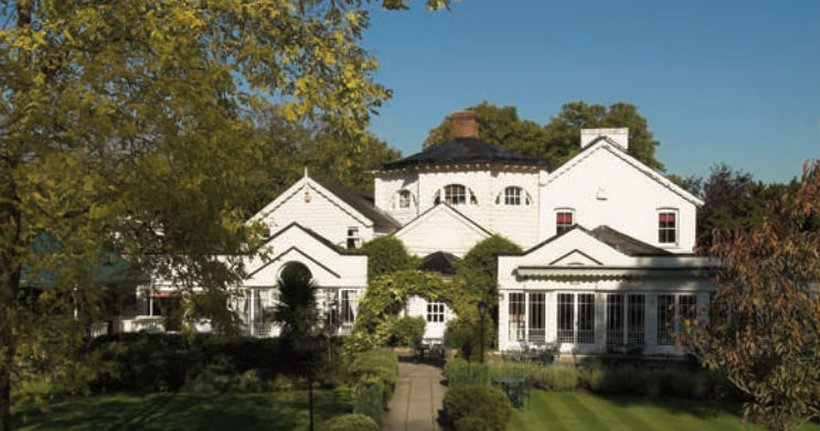
The Pavilion Building