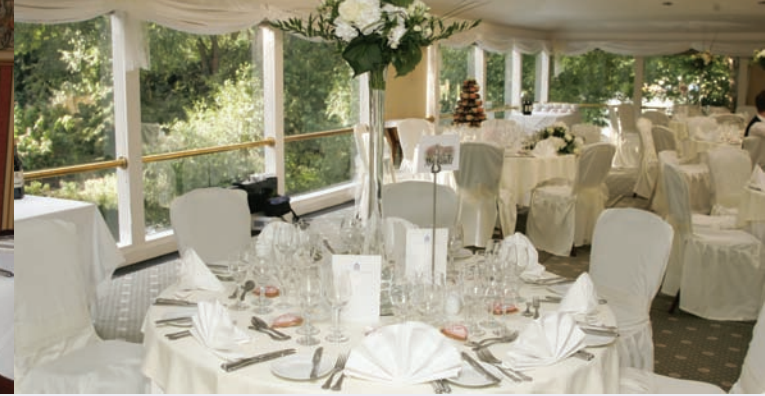
The River Room