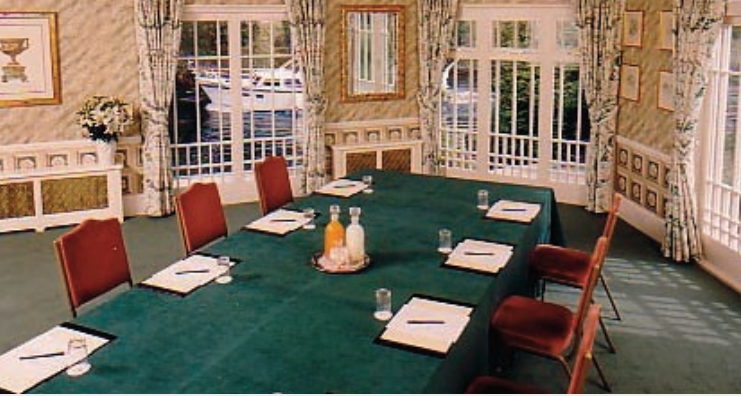
The Garden Room