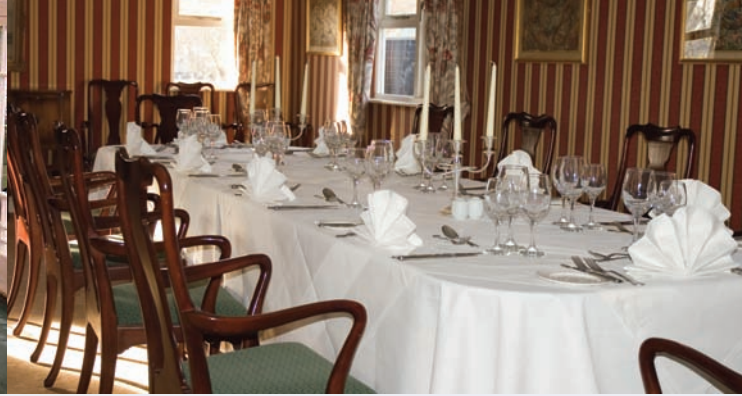
The Board Room